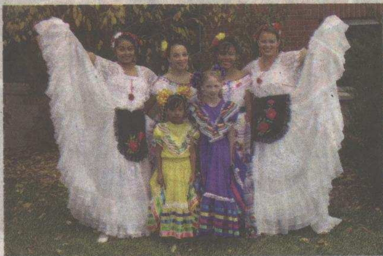
AFY | Courtesy photo

Future Plans: To continue to provide our present services and to